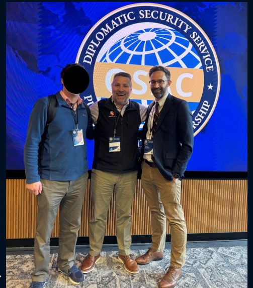
Above, Concilium President with an Insight volunteer analyst at the OSAC Annual Brief in Washington DC. November, 2024.

Insight also supported Concilium's various country and regional security collaboratives, providing analysis and guidance for the conflicts in Israel, the Gaza Strip, and Lebanon; the Syrian Civil War; jihadist activities in the Sahel; Russo-Ukraine War; and Sudanese Civil War. Insight also provided analysis for Concilium evacuations in Bangladesh, Concilium's kidnap for ransom responses in Haiti and Ecuador, and state-sponsored detentions of Gospel workers in the Middle East and North Africa.