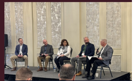
Executive Panel: FBI and State Department leaders speaking at the National Hostage Policy Roundtable.