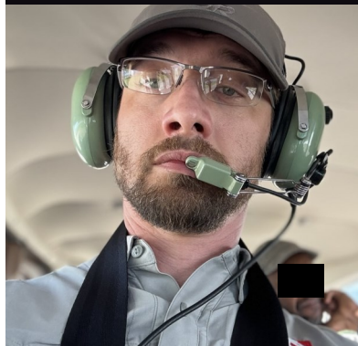
Concilium Secure Director flying in for a security assessment for a mission agency in Haiti.

For more than a decade, Concilium has been a leader in the practice of security risk management (SRM) among missionary and faith-based organizations. Concilium is also a trusted crisis management resource and partner, providing crisis consulting and response for the global Christian community.