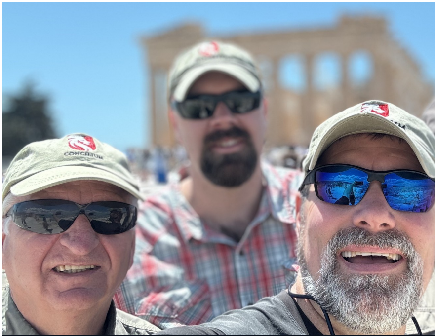
Concilium President with the VP of Operations and Concilium Canada Director at the Areopagus in Athens, Greece, after a Field Security Course in Albania. April, 2024.

“You cannot be obedient to Jesus and His call and not face negative consequences. This is why the Lord uses the stewardship of security to protect His people in their circumstances instead of from their circumstances.”