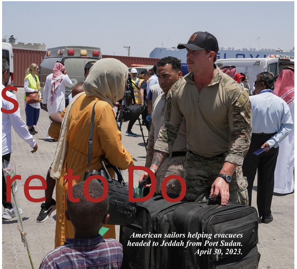
American sailors helping evacuees headed to Jeddah from Port Sudan. April 30, 2023.

With all that has occurred with Concilium's Sudan response, The Lord reaffirmed for all of us the power of cooperation and collaboration.