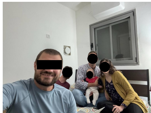
Concilium’s START leader was with a young missionary family in their bomb shelter when a church member in the USA called on their behalf seeking our assistance!