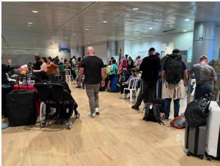
Evacuees at Ben Gurion International Airport in Tel Aviv. This picture was taken shortly before a rocket attack forced everyone to seek cover.

October 10, just three days after the attack, Concilium’s START team arrived in Amman, Jordan. From Amman the team traveled overland into the West Bank and Israel to