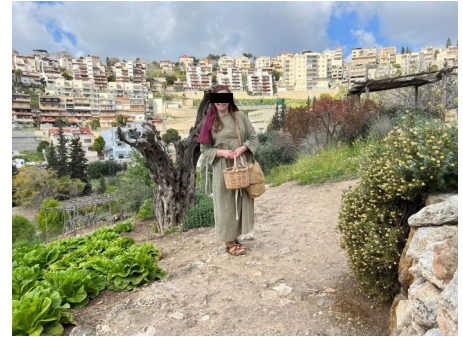
A photo of the young lady Concilium helped get to safety from the Palestinian Territories after October 7.

In one particularly acute response case, Concilium helped a single female missionary who was targeted for kidnapping safely