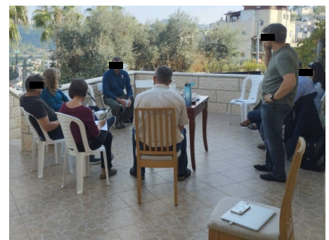
Concilium's START team providing guidance and training for a group of missionaries who chose to stay in Israel after the October 7 attacks.

Once evacuations were finished, the START team provided both security response and first aid training for multiple missionaries and gospel workers who were choosing to stay in Israel to minister despite the risks.