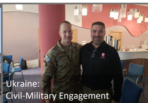
Ukraine: Civil-Military Engagement