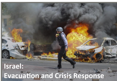
Israel: Evacuation and Crisis Response

Beyond legal responsibilities, Concilium recognizes that organizations are ultimately accountable before the Lord for how they navigate critical incidents. Our mission in crisis management and response is rooted in 1 Corinthians 3:10-15—serving as a "wise master builder" to help partners execute strategic, compassionate, and God-honoring crisis responses with wisdom and excellence. Thus, we empower organizations to build their crisis management capabilities with "gold, silver, precious stones" instead of "wood, hay and stubble."