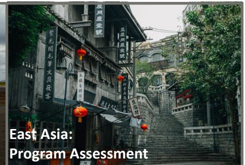
East Asia: Program Assessment

Later, the orphanage faced an attack. As a result of the contingency planning, all staff and children got to safety.