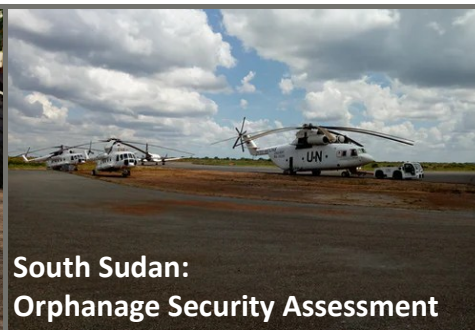
South Sudan: Orphanage Security Assessment

As a result of the assessment and security training, these hospitals are still open today serving in the name of Jesus!