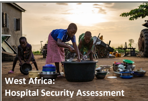
West Africa: Hospital Security Assessment

Concilium relies on the faithful giving of our supporters to make our security and consulting resources available to gospel workers and persecuted Christians who need our services but cannot afford them. Your faithful support makes this ministry possible!