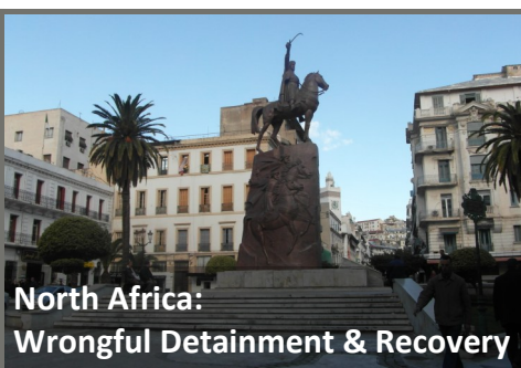
North Africa: Wrongful Detainment & Recovery

During the deployment, Concilium’s START team helped individuals and families safely evacuate while supporting those desiring to stay to prepare contingency plans and build go bags and shelter in place kits in order to build resilience into ministries facing new threats.