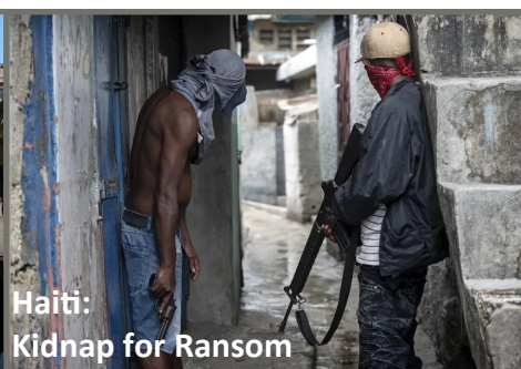
Haiti: Kidnap for Ransom

Concilium provided crisis consulting to the organization to include crisis communications, public and private sector engagement, and family support. Concilium advocated publicly and privately on behalf of the detained worker at all levels of the US Government including the Executive and Legislative Branches as well as meeting with members of the US Department of State and the US Embassy in country. These efforts led to the safe release and return of the missionary to the USA.