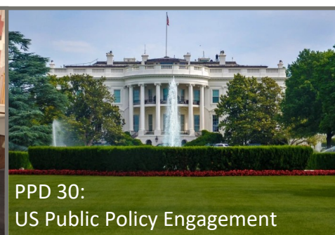
PPD 30: US Public Policy Engagement

NEED: Evacuation Coordination RESPONSE: State Dept. Engagement