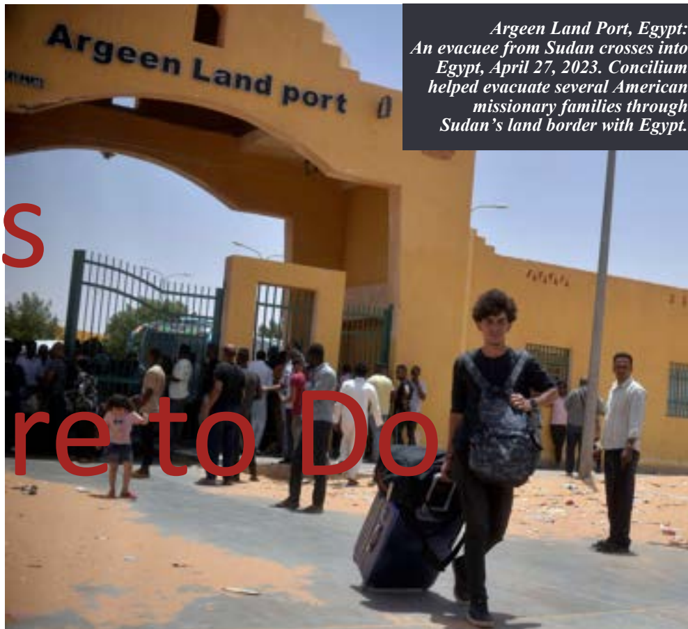
Argeen Land Port, Egypt: An evacuee from Sudan crosses into Egypt, April 27, 2023. Concilium helped evacuate several American missionary families through Sudan's land border with Egypt.

With all that has occurred with Concilium's Sudan response, The Lord reaffirmed for all of us the power of cooperation and collaboration.