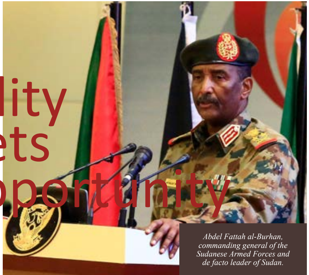
Abdel Fattah al-Burhan, commanding general of the Sudanese Armed Forces and de facto leader of Sudan.

It was clear that no civilians were going to evacuate Sudan by commercial or private air charter. Overland options out of greater Khartoum were the only viable options.