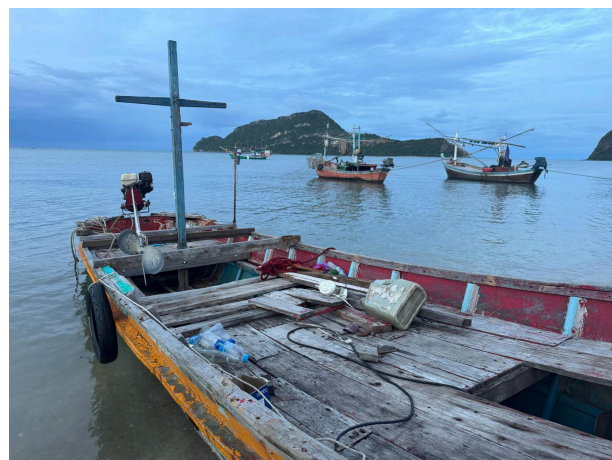
ABOVE: The boat of a Christian fisherman at a Concilium training in Southeast Asia. August, 2025.

Concilium's international team had a busy 2025. The year began with the celebration of a new family joining Concilium's international team in Thailand. They have successfully joined our international operations Director and his family as they serve abroad. It has been exciting to watch a young family with three children follow God's call and join Concilium in Asia.