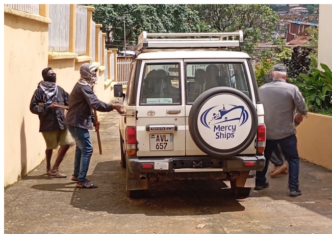
Concilium sent a training team from our US and Middle East Offices to run a 3-Day security training for missionaries in Sierra Leone--a fantastic course! August, 2025