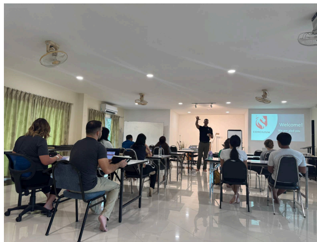
Concilium's International Team leading a 2-day training in Southeast Asia for Gospel workers from across Asia and the Pacific Rim. August, 2025.