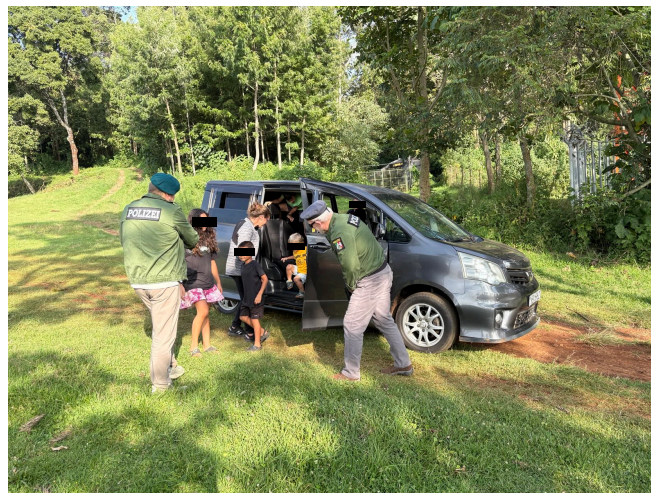
Concilium Kids is a fantastic program for missionary families with children of all ages. This course was held in Kenya for families serving in the Horn of Africa. Feb, 2025

Finances: This Ministry Happens Because of YOU! 11