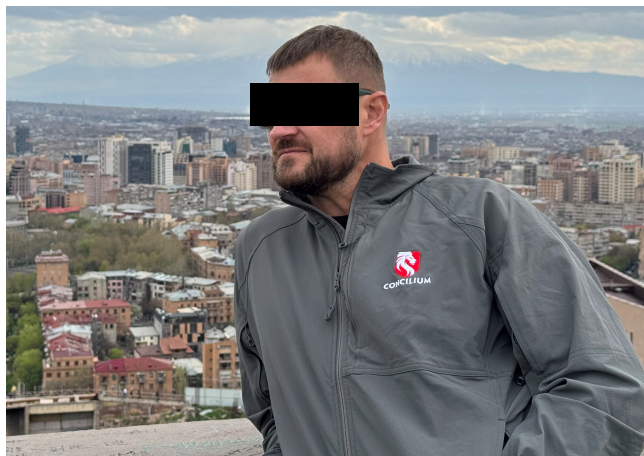
BELOW: Concilium's International Director overlooking Yerevan, the capital of Armenia during a training in Armenia. April, 2025.

Intentional fundraising was undertaken to support the deployment of START Teams as well as funding for at-risk Christians who cannot afford Concilium's training. God provided generously, including a new monthly donor investing directly in both our International Projects and Crisis Response Funds—fueling readiness when crises arise.