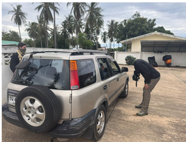
ABOVE: The international team applying classroom principles to immersion exercises in Southeast Asia. August, 2025.